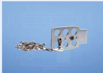
Lockout tag SZ150-1 To prevent inadvertent closing, e.g. during maintenance