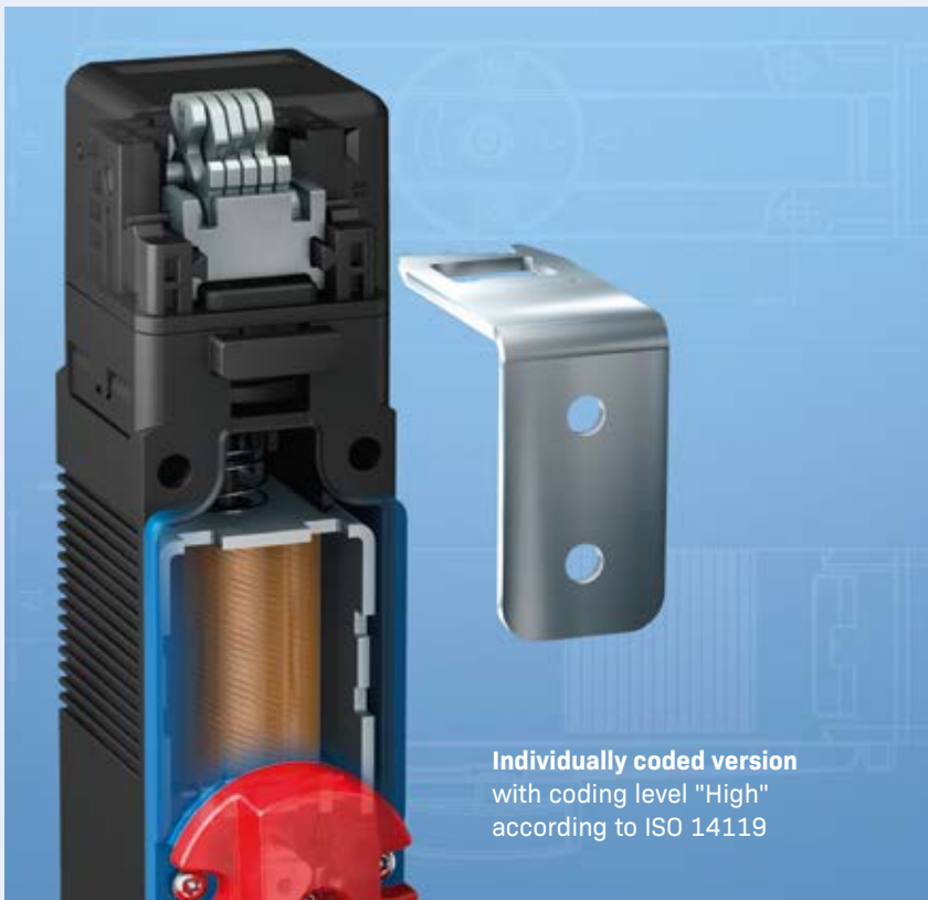
Individually coded version with coding level "High" according to ISO 14119