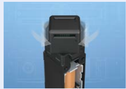
Rotating actuator head Actuator head can be rotated without loosening of screws