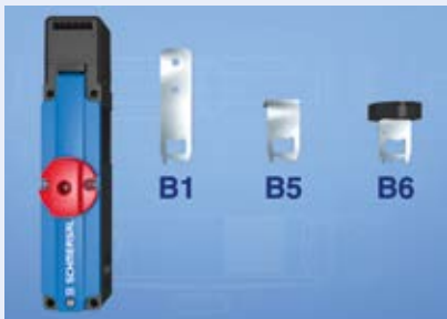
Actuators for all mounting situations B1 (straight), B5 (angled), B6 (flexible)

Solutions for a broad range of applications